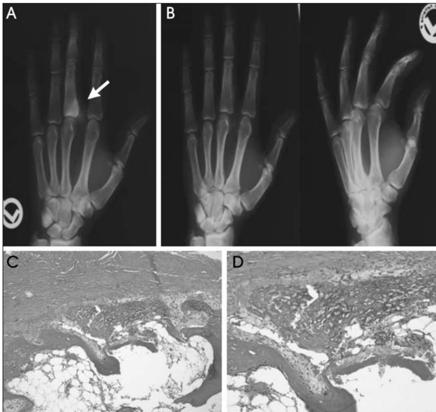
FIG. 2. Imaging results for a 37-year-old man with bizarre parosteal osteochondromatous proliferation. (A) Plain radiograph of the left hand showing a dense mass (arrow) extending from the dorsal radial aspect of the third proximal phalanx. (B) Radiograph taken 28 months postoperatively indicating that the man was free from local recurrence. (C) Light micrograph of the lesion consisting of a cartilaginous cap and a poorly developed zone of enchondral ossification (hematoxylin and eosin stain; original magnification \times 100 ). (D) Light micrograph of the osteocartilaginous interface of the lesion showing disorganized cartilage with irregular ossification (hematoxylin and eosin stain; original magnification \times 200 ).

Bizarre parosteal osteochondromatous proliferation is an uncommon reactive mineralizing mesenchymal lesion that typically affects the surfaces of bones in the hands and feet, usually the proximal and middle phalanges, and the metacarpal and metatarsal bones. 7 These lesions have a remarkable tendency to